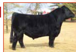
CDI Innovator 325D A.I. Sire to Lot 39

HTP/SVF Packin Heat W339 Packin' Knockout A71D HPF Miss Knockout X071 3C Macho M450 BZ GVC Show Girl Sandeens Show Girl