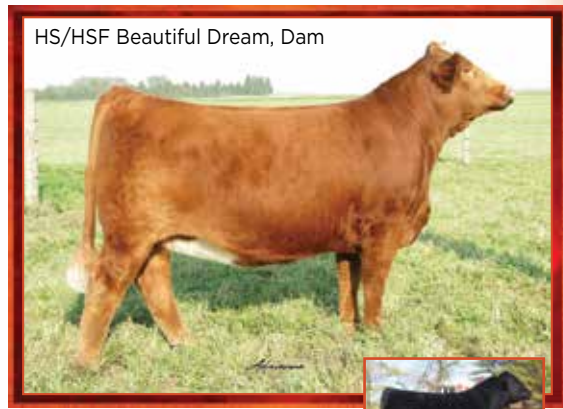
HS/HSF Beautiful Dream, Dam

A.I. Sire: CDI Innovator 325D on 5-23-19 Est. Plan Mating EPDs: 13 .35 84 127 .27 6 20 62 13 13.8 Carcass: 53.6 -.36 .16 -.07 1.12 125 79 Pasture Sire: VPF/KLOP Prime Time 72D from 6-1 to 9-1-19