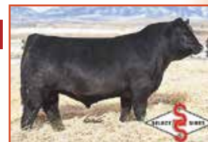
Koch Big Timber 685D A.I. Sire to Lot 37

Triple C Singletary S3H CCR Cowboy Cut 5048Z CCR Ms. 4045 Time 7322T S A V Brand Name 9115 WLM Ms. Brand A071 WLM Ms. 232 X715