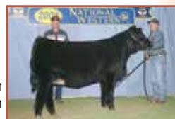
SS Ebonys Reflection Dam

Reserving the right to one successful flush at buyer's convenience and owner's expense.