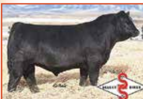
Koch Big Timber 685D A.I. Sire to Lot 34

Pasture Sire: Drake Song And Dance Man from 5-1 to 8-1-19