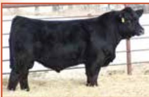
W/C Utah 6C Sire to Lots 31-33

Pasture Sire: Drake Song And Dance Man from 5-1 to 8-1-19