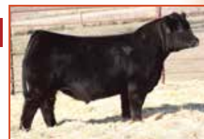
W/C Night Watch 84E A.I. Sire to Lot 38

HILB Maverick A43 Warren Citation C22 HILCO Ms. Hayley 24Y Boyd Signature 1014 Warren Georgia's Peach 604 Boyd Georgina 2065