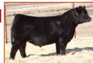
W/C Night Watch 84E A.I. Sire to Lot 48 & 49

Mr. NLC Upgrade U8676 MSF Battle Cry BT17 MSF Lily S A V Final Answer 0035 MSF Amaretto AY46 MSF Rockin Reba Y46K