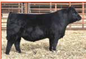
Hook's Black Hawk 50B A.I. Sire to Lot 44 & 45

A.I. Sire: W/C Night Watch 84E on 5-1-19 • Safe Est. Plan Mating EPDs: 12 .9 68 99 .20 6 22 56 18 12.3 Carcass: 22.55 -.41 .09 -.09 .75 133 72 Pasture Sire: MSF DB59 from 5-25 to 6-30-19