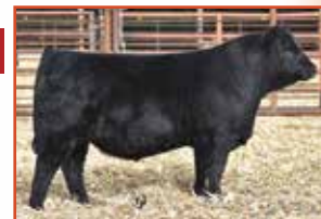
Hook's Black Hawk 50B A.I. Sire to Lot 47

Hooks Shear Force 38K MSF Fortify YW96 MSF Carmella Mr. NLC Upgrade U8676 MSF Burning Ambition Elm-Mound Grdmaster Y153