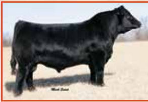
HL Duracell C139