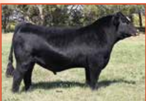
Mr. CCF 20-20

A.I. Sire: W/C Bankroll 811D on 6-10-19 Est. Plan Mating EPDs: 14 -.75 60 85 .16 8 24 54 19 5.95 Carcass: 20.25 -.45 .01 -.09 .84 135 68 Pasture Sire: VPF/Core Lock Down D26 from 6-25 to 9-1-19