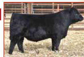
Hook's Black Hawk 50B A.I. Sire to Lot 40

GLS New Direction X184 MSF Aerodyne A24 HILCO Ms. Hayley 24Y MSF Sundance X11D MSF Shantilly Creme