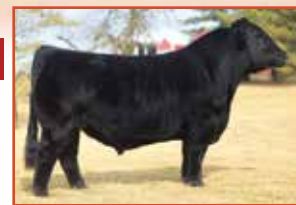
CDI Innovator 325D A.I. Sire to Lot 46

HTP/SVF Packin Heat W339 Packin' Knockout A71D HPF Miss Knockout X071 B C Lookout 7024 BMR Sheeza Dream X101 CNS Sheeza Dream N107