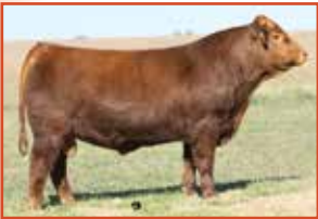
IR Imperial D958 A.I. Sire to Lot 42

A.I. Sire: CDI Innovator 325D on 5-23-19 Pasture Sire: VPF/KLOP Prime Time 72D from 6-1 to 9-1-19