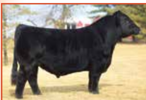
CDI Innovator 325D A.I. Sire to Lot 35

Pasture Sire: VPF/KLOP Prime Time 72D from 6-1 to 9-1-19