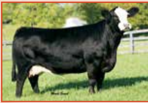
JM Steel My Heart Dam of Lot 41

This heifer is a result of an embryo package I bought from Sloup Simmentals out of their powerhouse donor Steel My Heart (full sib to HOC Broker). She is sired by the female maker legend himself Silverias Style 9303. This is a heifer I probably shouldn't be selling but I wanted to bring my best to this sale!