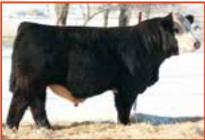
W/C Lock N Load 1143Y

Pasture Sire: HL Duracell C139 from 6-1 to 9-1-19 • Confirm: 6-5-19