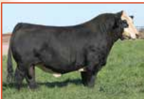
W/C Bankroll 811D

A.I. Sire: W/C Lock N Load 1143Y on 4-10-19 Est. Plan Mating EPDs: 13 -.45 53 78 .16 7 20 46 14 5.35 Carcass: 23.1 -.41 -.17 -.10 .72 98 53 Pasture Sire: W/C Utah 6C from 5-15 to 8-1-19