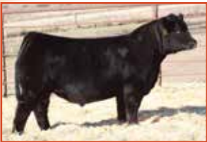
W/C Night Watch 84E A.I. Sire to Lot 43

A.I. Sire: IR Imperial D958 on 5-1-19 • Safe Est. Plan Mating EPDs: 19 -2.75 60 88 .18 11 27 57 20 14.25 Carcass: 14.1 -.36 .35 -.07 .69 162 79 Pasture Sire: MSF DB59 from 5-25 to 6-30-19