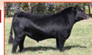
Mr. CCF 20-20 A.I. Sire to Lot 36

Remington Lock N Load 54U W/C Lock N Load 1143Y Aubreys Black Blaze III 10C